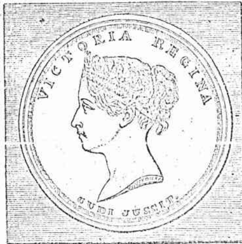
THE ROYAL INSTITUTE OF BRITISH ARCHITECTS, AND THE ROYAL MEDAL.