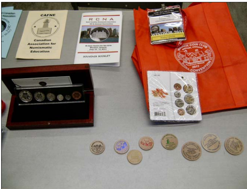
Also there were program booklets, the 1911-2011 commemorative coin set released at the Convention by the RCM, an uncirculated Windsor set and convention wooden money.

As a reminder, our next club meeting is August 23 rd , 2011, in the Gibson Room, on the second floor at the top of the stairs in the new Edithvale Community Centre building. There will be a meeting of the club executive three weeks later on September 13 in the Boardroom.