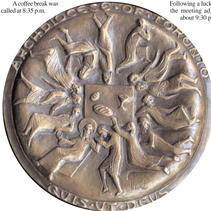
Last Supper art medal by Dora de Pédery-Hunt

Following a lucky draw, the meeting adjourned about 9:30 p.m.