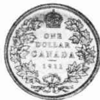
1911 DOLLAR ON DISPLAY