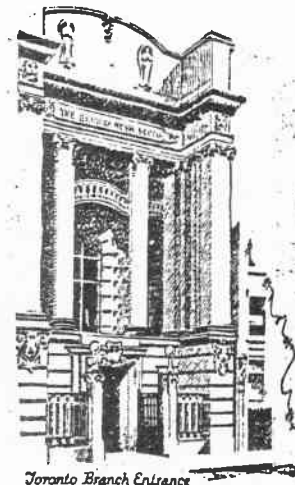
Toronto Branch Entrance